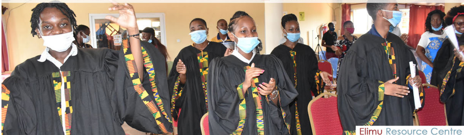
Elimu Resource Centre