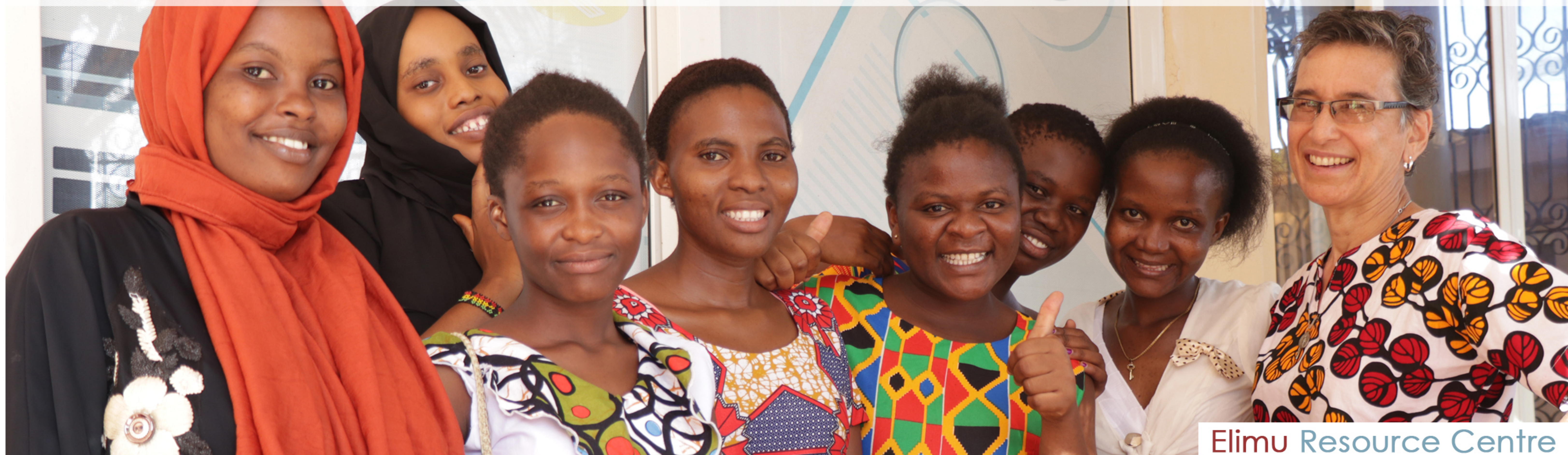
Elimu Resource Centre