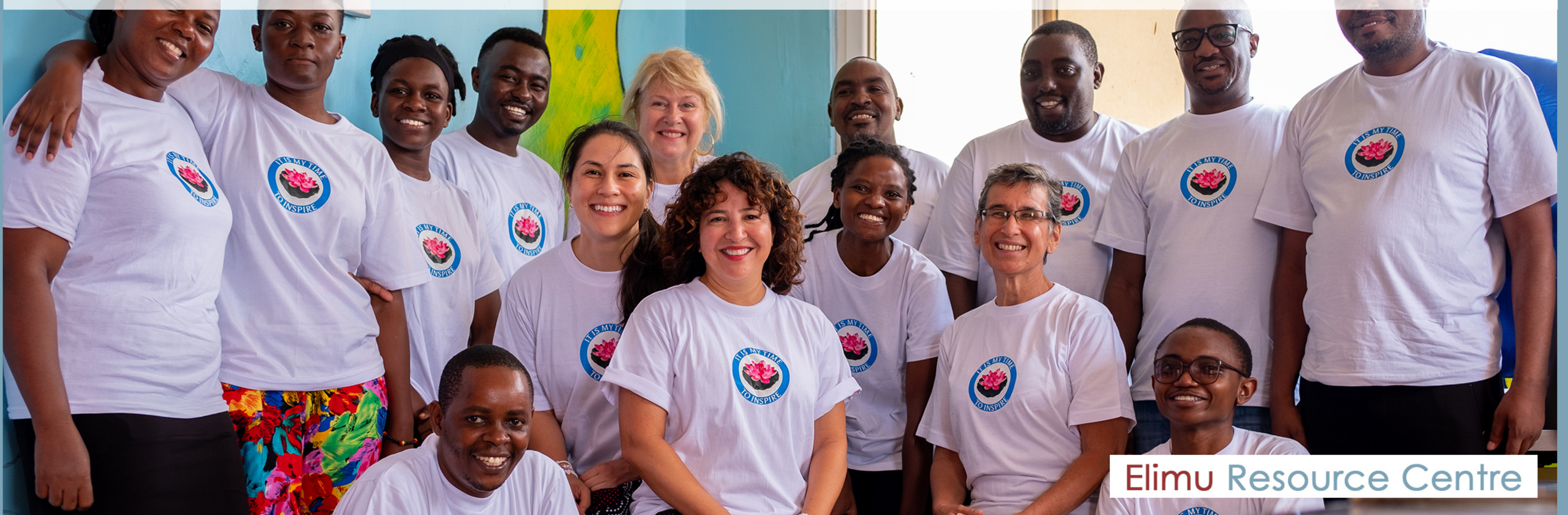
Elimu Resource Centre